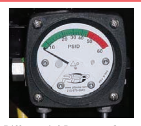
Differential Pressure Gauge with Stainless Steel Tubing

Please check maximum viscosity of oil in coldest condition.