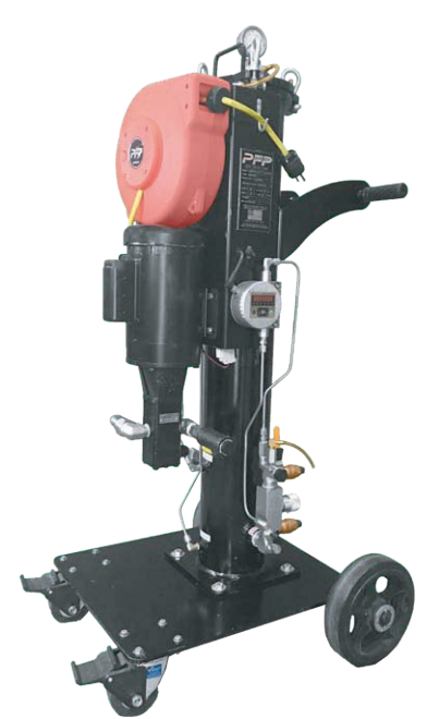
LCFC Filter Cart Above Shown with 5 GPM Pump and Optional Particle Counter