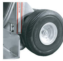
10" No-Flat Pneumatic Tires