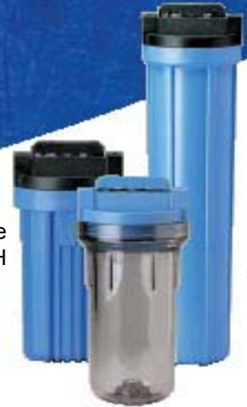
#20 Blue VIH