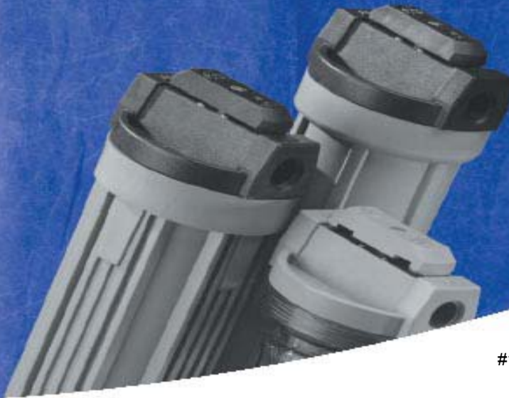
#10 Blue VIH