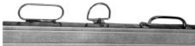
BAILHANDLES stock #1007

HANDLES - Handles are available upon request at an additional cost. Please specify exact location required. The Handles available are: