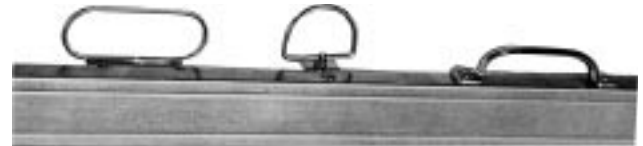
BAILHANDLES stock #1007 LOCK-TYPE HANDLES stock # 1009 RIGIDHANDLES stock #1010

HANDLES - Three types of handles are available, at an additional cost. Bail, Lock-type and Rigid handles facilitate filter removal and installation.