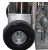
10" Pneumatic Wheels