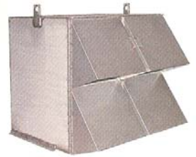
Four Panel S12 304SS filter unit designed to meet specific installation needs.

(1)Dimensions are approximate. Refer to approval drawings for actual dimensions & tolerances.