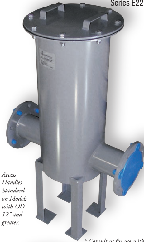
Access Handles Standard on Models with OD 12" and greater.

*When used for coalescing services, housings must be installed with flow reversed from that shown above. Inlet flow should travel first to the inside of the filter element, passing through the media to the outside. Coalesced liquids will also pass through the element to collect in sump area below.