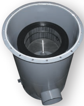
Note maintenance free 304SS safety cage and high performance filter element. PE connections (Housing cover & filter element sealing plate removed)

* Consult us for use with reciprocating compressors, or designs to 15 psid.