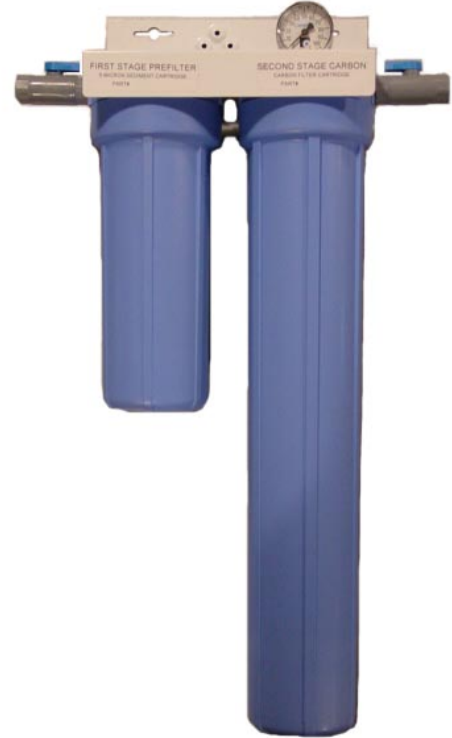
PFP15-IMH ICE MAKER FILTER