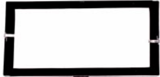
NS-100 FILTER HOLDING FRAME