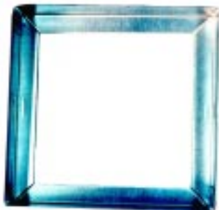
NS-50 FILTER HOLDING FRAME

SPECIALS - Special sizes are available in the NS-100 FILTER HOLDING FRAMES. Please indicate exact height, width and depth needed. Minimum size for a special is 6" and maximum is 60". 3" and 4" frames are available as well as 16", 20" and 24" V-Brackets. Clips to hold a 1", 3" and 4" filter, as well as P Clips are available at an additional cost. This frame can also come in 16 gauge Aluminum.