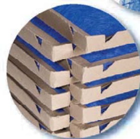
Notched Frame Design