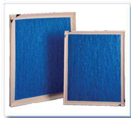
Pinch Frame Design