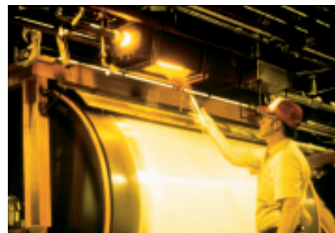
Continuous filament glass fibers are drawn from a furnace onto a revolving drum to form a dense, interlaced mat.

The chipboard filter frame, free of sharp edges, makes the panel easy to install and remove. After removal, the filter can be safely folded for compact disposal.