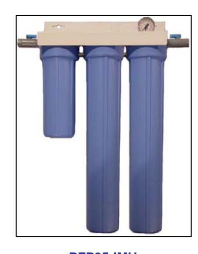
0.75 GPM (2.9 LPM)